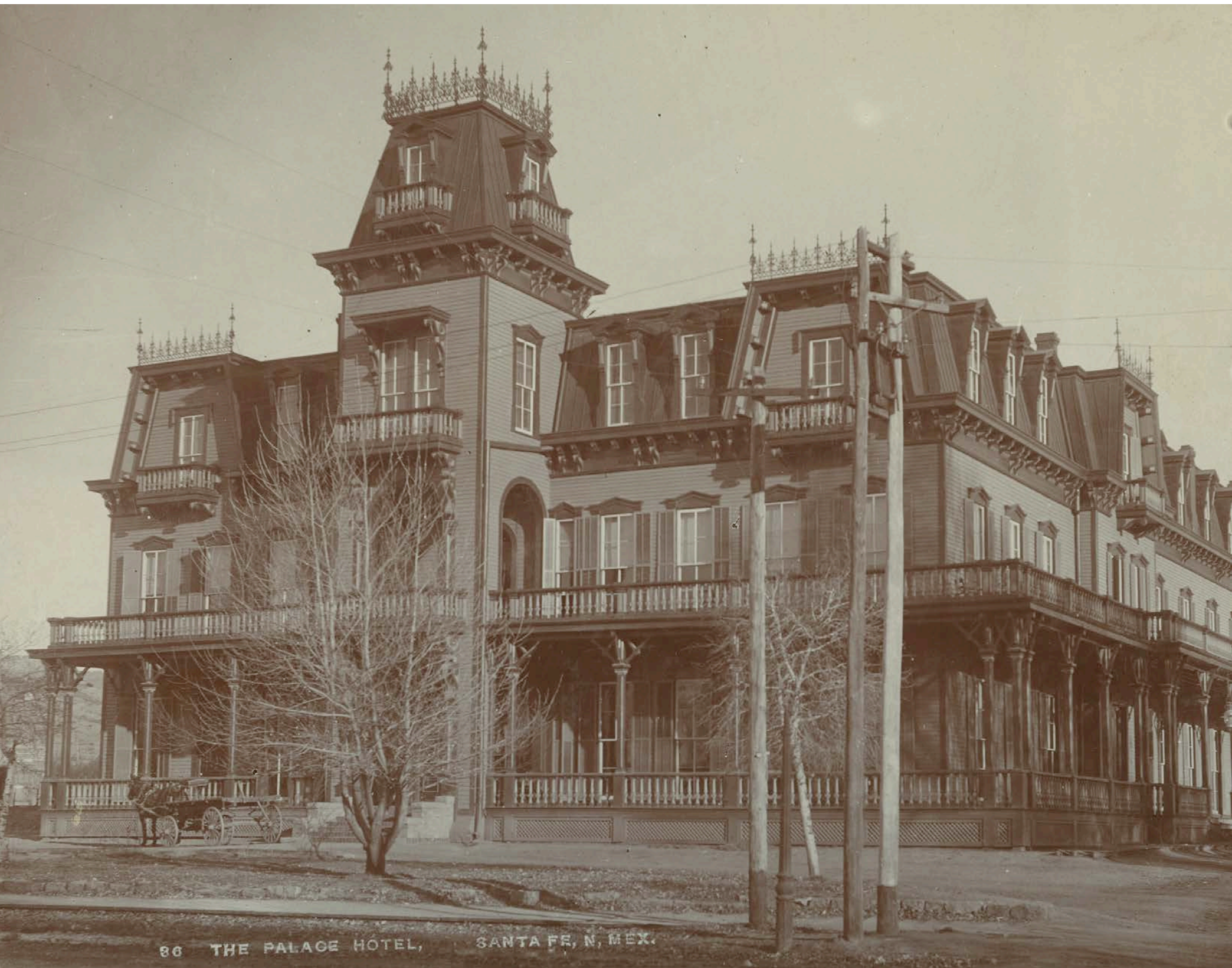
PREVIOUS PAGES AND ABOVE: THE ORIGINAL PALACE FROM THE NEW MEXICO HISTORICAL ARCHIVES OPPOSITE: THE PALACE MODERN. PHOTOS SETH ANDERSON.